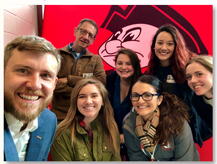
Eadie Hill Volunteers

The goal of the 3Rs program is to connect lawyers, judges, law students, and paralegals with 11th grade students enrolled in U.S. Government classes. The curriculum generally helps foster an understanding and appreciation of the U.S. Constitution and focuses on career counseling, freedom of speech, checks and balances, how laws are interpreted, and a special lesson on police encounters based upon current, realworld examples.