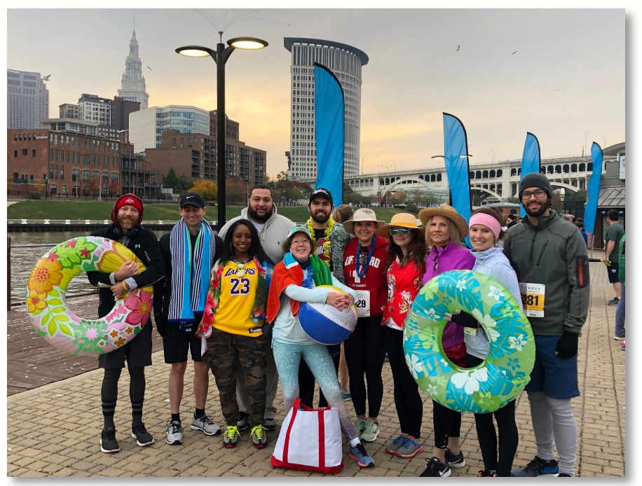
Nurenberg Paris "Jury Pool"

The team at Lowe Eklund Wakefield volunteered their time by helping to count, sort, stock, and pack cold-weather items for distribution ahead of the winter season. SC4K relies on volunteers to sort, pack, and distribute over $4 million worth of new shoes, clothes, and school supplies to thousands of children annually.