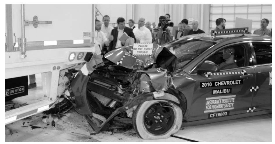
Live crash test at the Truck Underride Roundtable