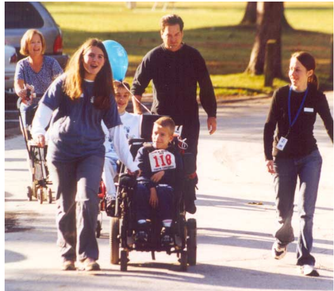
The CATA Youth Challenge Regatta.