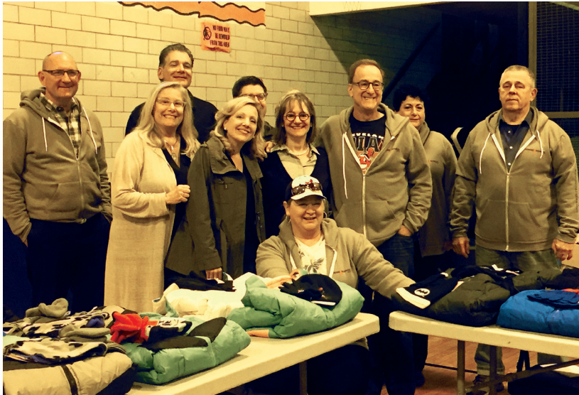
CATA members await the arrival of the preschool children at the Merrick House.

choose new winter coats, boots, hats and gloves for the upcoming winter season. The children first gathered in small groups to hear a CATA member read stories, then were assisted by the other CATA members in choosing their winter outerwear. The CATA donations also enabled 160 school age children to select new winter clothing in the after-school program at the Merrick House. Thank you to everyone who helped and contributed to making this event a great success. Our hearts are full! ■