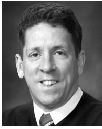
Judge Frank G. Forchione is a judge on the Stark County Court of Common Pleas General Division in Canton, Ohio, where he was first elected in 2008, and re-elected in 2014.